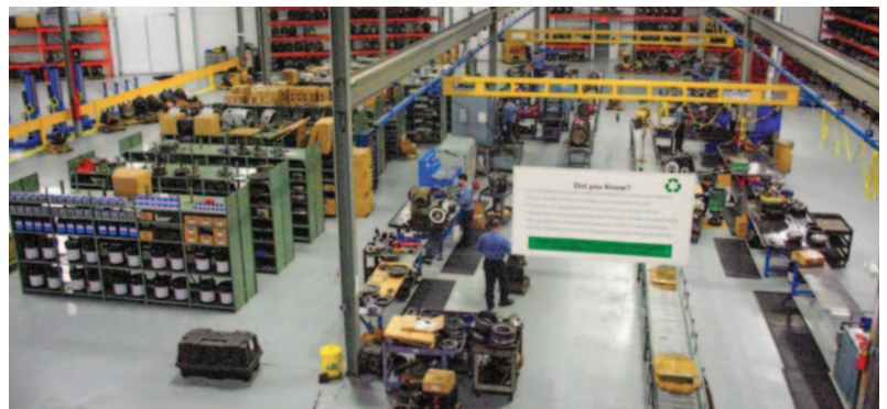
State Of The Art Remanufacturing Facilities