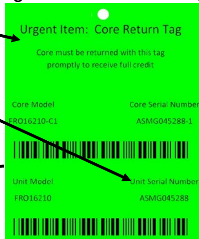
Figure 1b - Core Return Tag

Note: If you are missing a Core Return Tag, contact the Call Center or download a replacement Core Return Tag at www.trcreman.com/promotionsandliterature.php . Required info to be filled in by the customer.